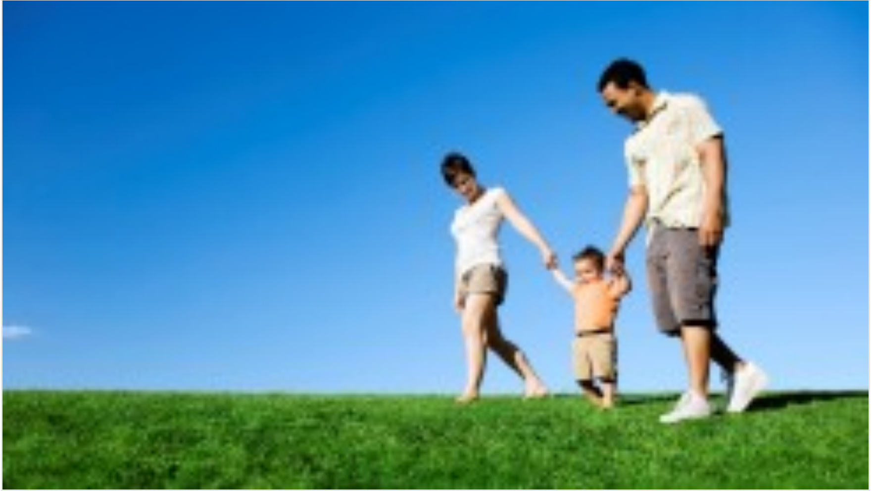
The one trick life insurance companies don't want you to know