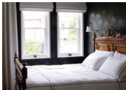
Jane Cappleman - Black and White chic

White is light and versatile and easy to maintain.