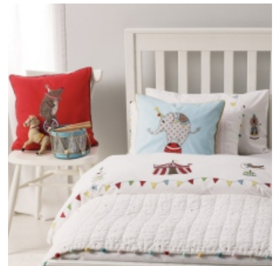
The White stuff - children's bedroom

Provencal White Rattan - The French Bedroom Company