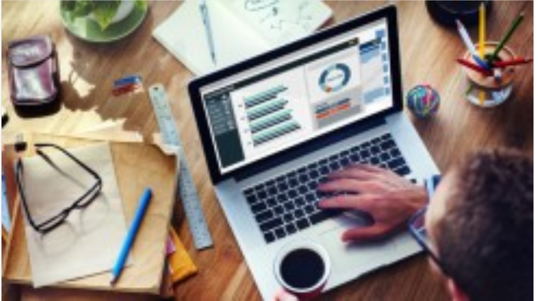
Want a better deal? 5 reasons to consider transferring your ISAs