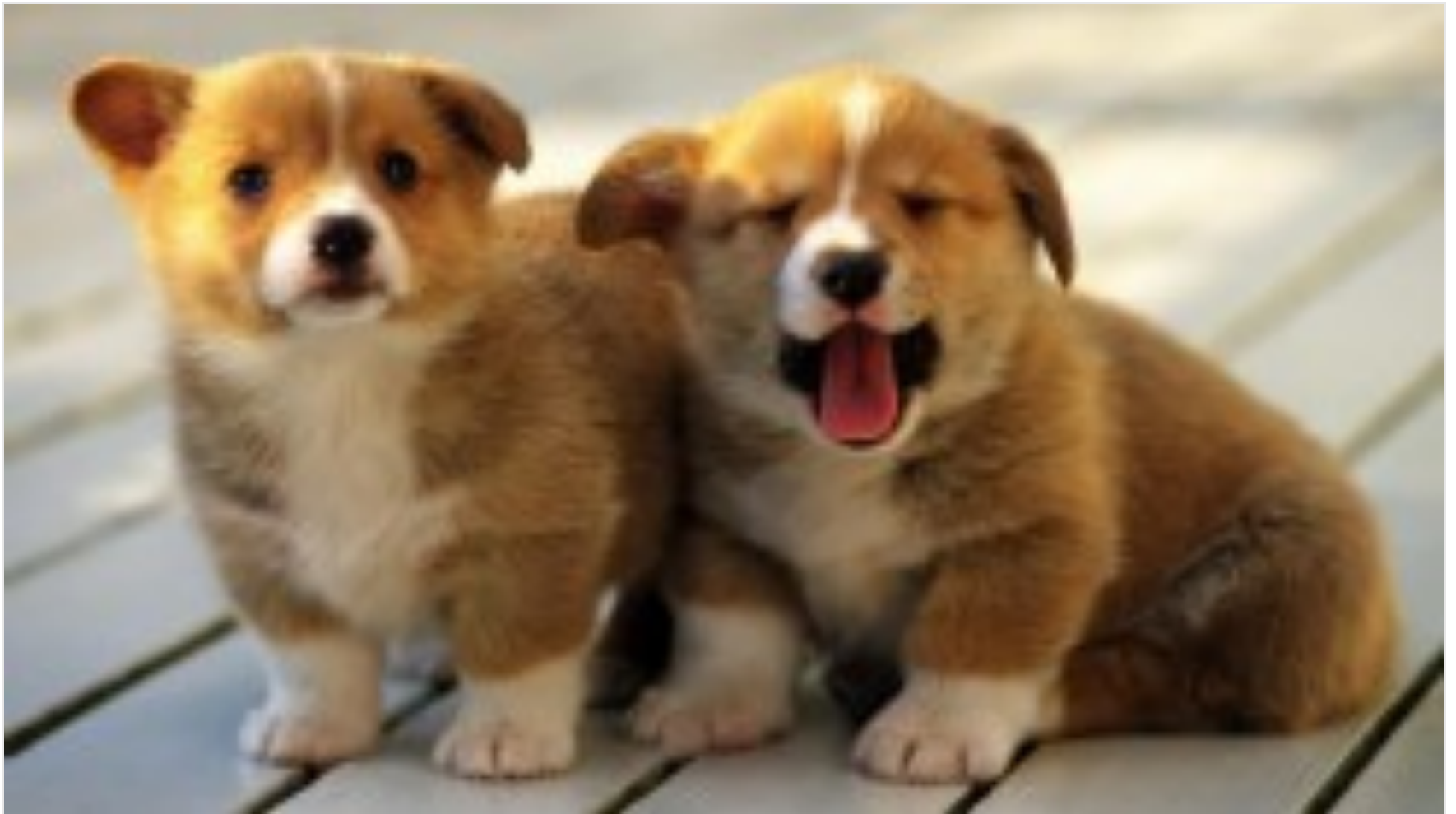
Want to spend your days surrounded by puppies?