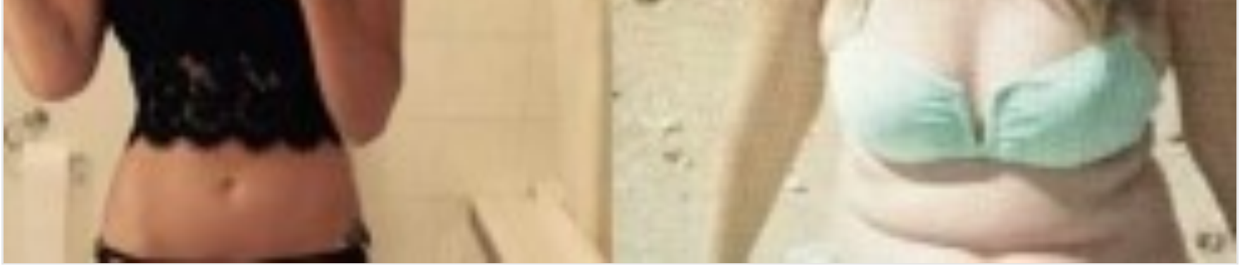
Fans Fear Charlotte Crosby's Now Worryingly Thin