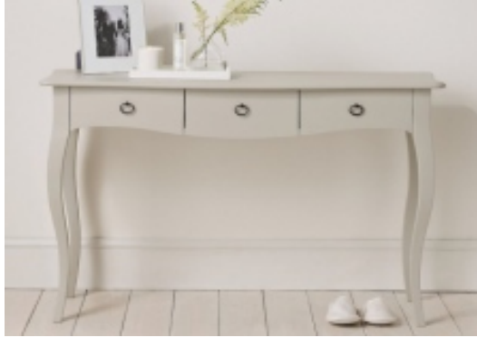
White dressing table - The White Company

Provencal White Rattan - The French Bedroom Company